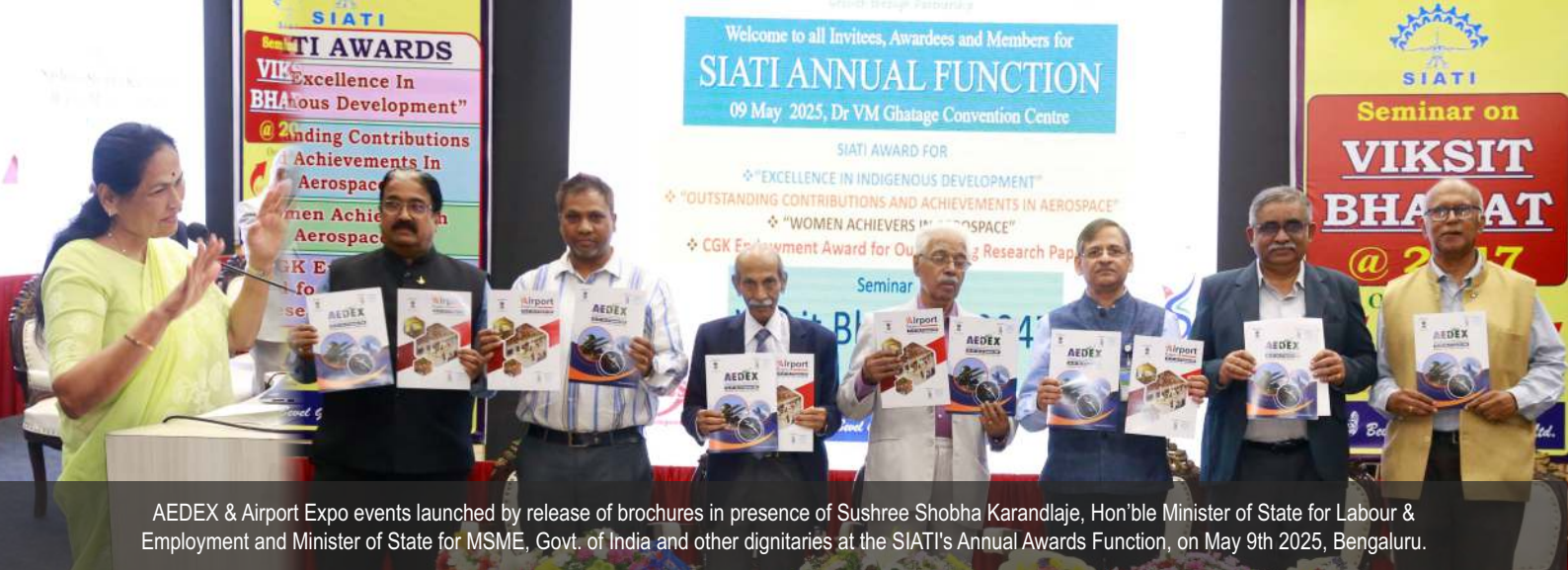
AEDEX & Airport Expo events launched by release of brochures in presence of Sushree Shobha Karandlaje, Hon'ble Minister of State for Labour & Employment and Minister of State for MSME, Govt. of India and other dignitaries at the SIATI's Annual Awards Function, on May 9th 2025, Bengaluru.