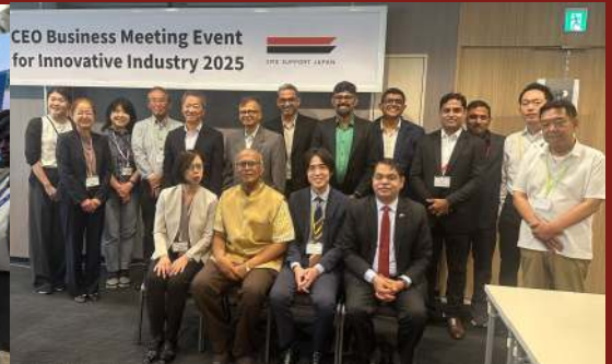
SIATI Delegation at SME SUPPORT JAPAN (SMRJ)