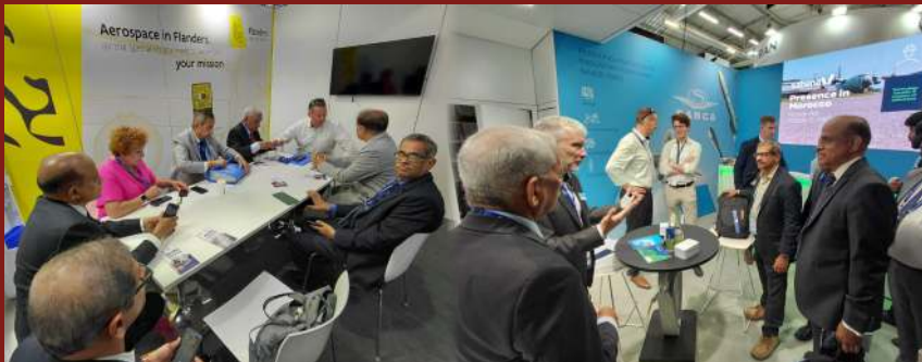
The Paris Air Show 2025