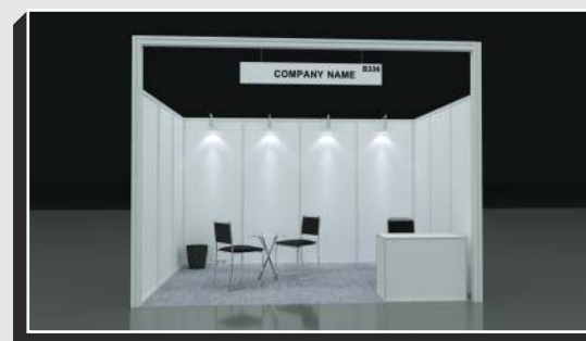
Sample Image of a Shell Scheme / Built-up Stall